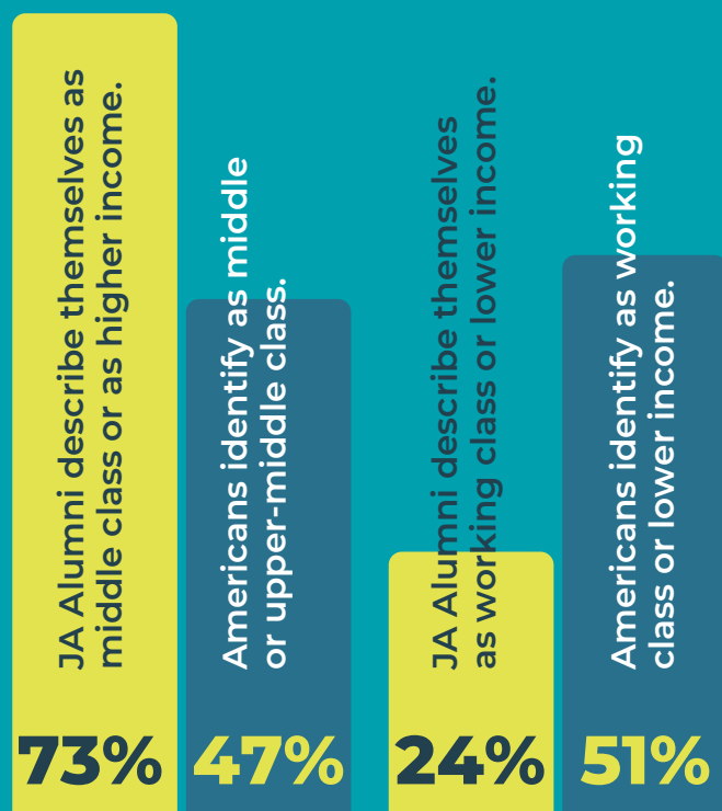
Millennial and Generation Z's thoughts on their socioeconomic status.

In comparison, while 73 percent of Millennial and Generation Z JA Alumni describe themselves as middle class or as higher income, research by Gallup shows that only 47 percent of Americans in those generations identify as middle or upper-middle class. While 24 percent of JA Alumni in the same age range describe themselves as working class or lower income, 51 percent of Americans identify the same way, according to Gallup.